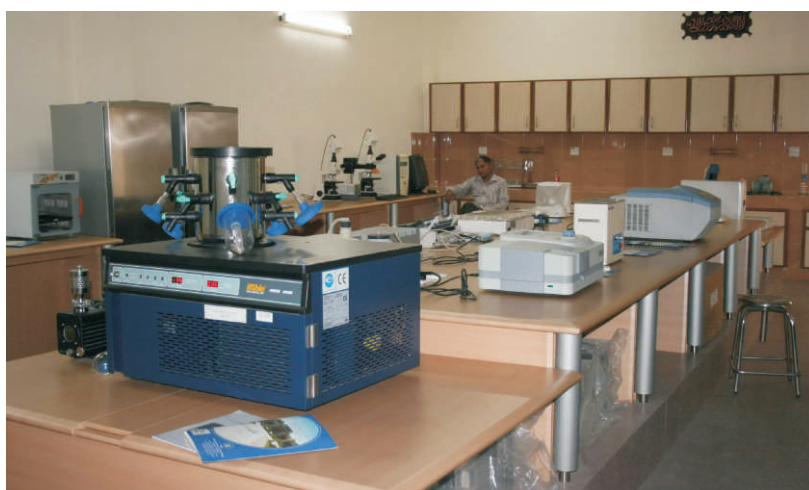
AIC Visit to Labs of Institute of Plant Pathology, Uni. of the Punjab, Lahore

20. The academic Programs of the Institute of Plant Pathology should be strengthened in major areas such as Plant Virology, Fungal Systematics, Plant Nematology and Phyto-bacteriology. The institute should address major weaknesses/threats discussed in this report.