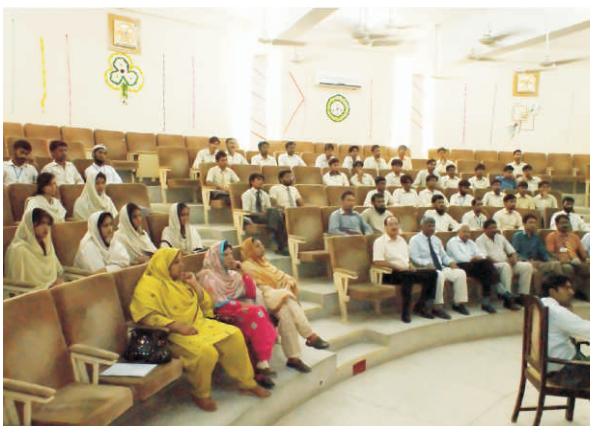
Awareness Seminar at Islamia University, Bahawalpur

visited for the seminars included University Agriculture College, Sargodha, Faculty of Agriculture, Gomal University, D.I.Khan; University College of Agriculture, Bahauddin Zakariya University, Multan; and University College of Agriculture & Environmental Sciences, Bahawalpur.