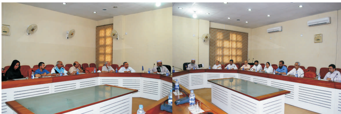
AIC Members with the Vice Chancellor KPK Agricultural University, Peshawar

15. The HODs of the disciplines of Soil Science and Plant Pathology offered their degree programs in May, 2010. However, the program of on-site visit was decided from June 23-24, 2010 with the mutual consent of all concerned. Program-wise Self Assessment Reports were received from the Quality Enhancement Cell (QEC) which were multiplied for Program Evaluators. A set of reading material relevant to accreditation process was provided to the all members of the AICs during a briefing at the NAEAC Secretariat. The composition of AICs as well as schedule of accreditation activities at KPK Agricultural Universities, Peshawar was approved by the Chairman NAEAC 4 .