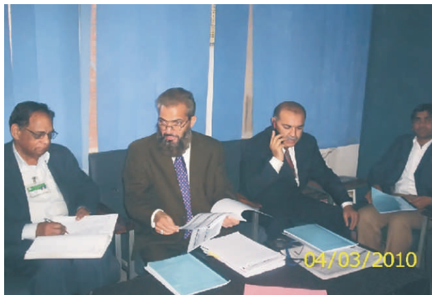
AIC Members at work

12. On the basis of the inspection/evaluation, the review teams unanimously recommended accreditation of the degree programs of the departments of Agronomy and Plant Pathology, PMAS Arid Agriculture University, Rawalpindi in the “X” category as per HEC rating system i.e. Degree Program having minor shortfalls (Annexure-I).