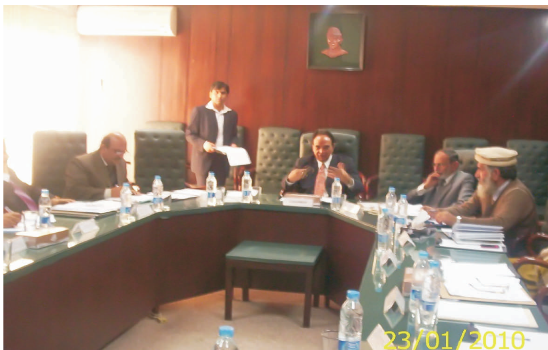
Fourth Meeting of NAEAC at Mural Hall, HEC

members to the meeting and thanked them for their guidance and cooperation. The Chairman informed the meeting that the Council has been moving forward steadily and progressively since it started its operation in September, 2007. In a short span of a little more than 2 years, its evaluation and accreditation activities increased from two degree programs in 2007-08 to eight in 2008-09 at the University of Agriculture, Faisalabad; Khyber Pakhtunkhwa Agricultural University, Peshawar and PMAS Arid Agriculture University, Rawalpindi. During the evaluation process, every effort was made to demonstrate high standard of quality, collegiality and professionalism. During 2009-10, it is planned to carryout on-site visits for accreditation of 16 degree programs covering eight disciplines at the Faculty of Crop and Food Sciences at PMAS AAU, Rawalpindi; UAF, Faisalabad; and KPK Agricultural University, Peshawar, reflecting an increase of 100% over FY 2008-09. Out of planned on-site visits of 16 degree programs of which four degree programs (two disciplines) of PMAS AAU, Rawalpindi have already been accomplished as of December, 2009.