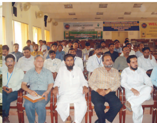
Awareness Seminar at Uni. College of Agriculture, Sargodha