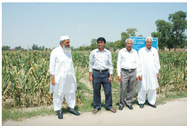
AIC Members visit Research Farm, Department of Agronomy, UAF

13. After receiving the letter of Intent (LOI) from the Dean faculty of Agriculture offering two disciplines of Agronomy and Agricultural Entomology for external evaluation and accreditation in the last week of April, 2010. Two AICs one each for Agronomy and Agricultural