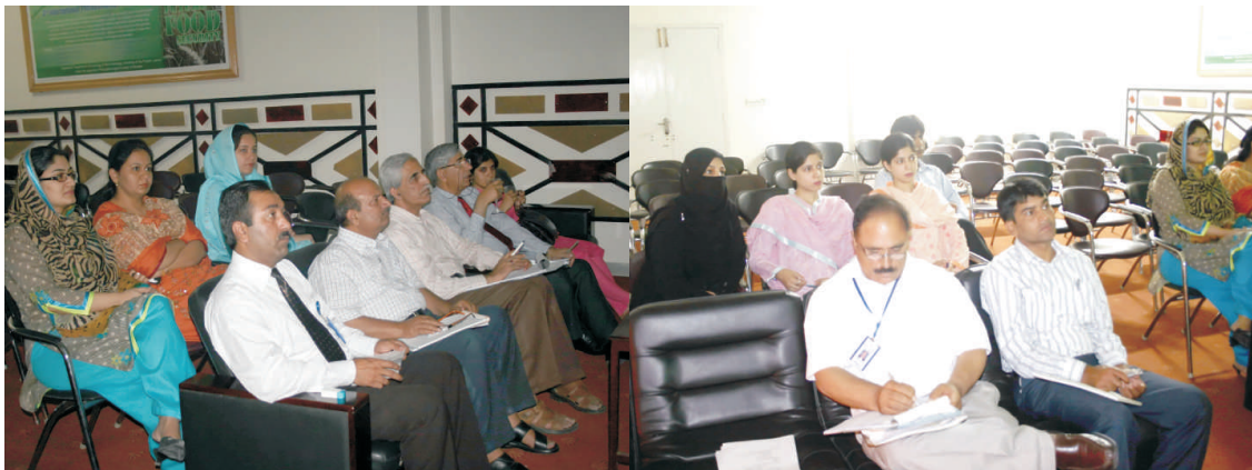
Incharge IPP, delivering presentation about Department, University of the Punjab Lahore

faculty members, students and support staff. Meetings with peer faculty and Dean of the faculty were also organized. The committee successfully completed its assignment within two days. NAEAC Secretariat has received the AIC report for consideration in the next meeting of the Council.