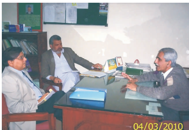
AIC Members meeting with the Dean

11. Head of Departments of these disciplines offered degree programs for evaluation in February, 2010. Self-assessment reports and Institutional data were collected from the HODs. It was agreed to organize the on-site visit of the AICs from March 03-04, 2010. Competent Authority