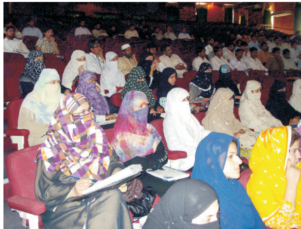
Awareness seminar at Faculty of Agriculture, D.I.Khan

22. The Council organized four Awareness Seminars for the stakeholders at four different agricultural education institutions to apprise and sensitize them regarding the significance of accreditation process for quality assurance, learning innovations and capacity building. The agriculture education institutions