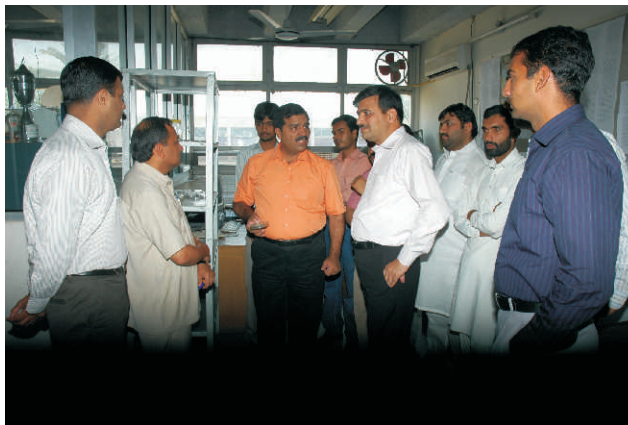
AIC Members visit lab of Department of Entomology, UAF

14. On the basis of the inspection/evaluation, the AICs unanimously recommended accreditation of the degree programs of the departments of Agronomy and Agricultural Entomology, University of Agriculture Faisalabad in the “X” category as per HEC rating system i.e. Degree Program having minor shortfalls (Annexure-I).